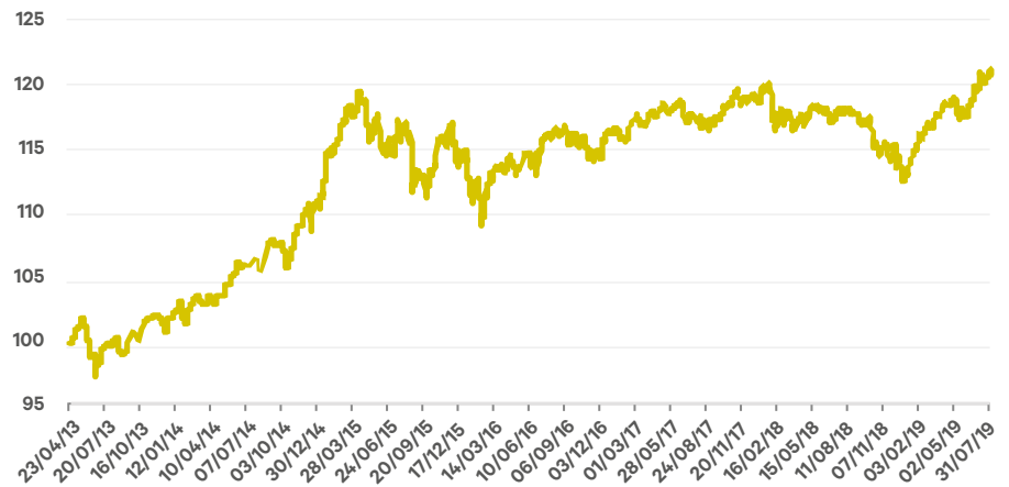
Figure 1: Performance of Davy Cautious Growth Fund at 31st July 2019 6

WARNING: Past performance is not a reliable guide to future performance. The value of your investment may go down as well as up. This product may be affected by changes in currency exchange rates.