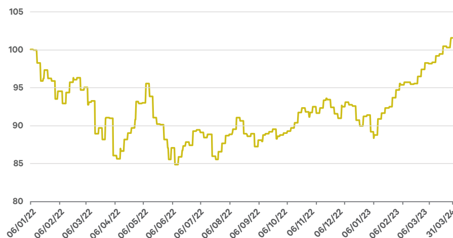
Figure 1: Performance of Davy SRI Long Term Growth Fund at 31 st March 2024

Warning: Past Performance is not a reliable guide to future performance. The value of your investment may go down as well as up. This product may be affected by changes in currency exchange rates.