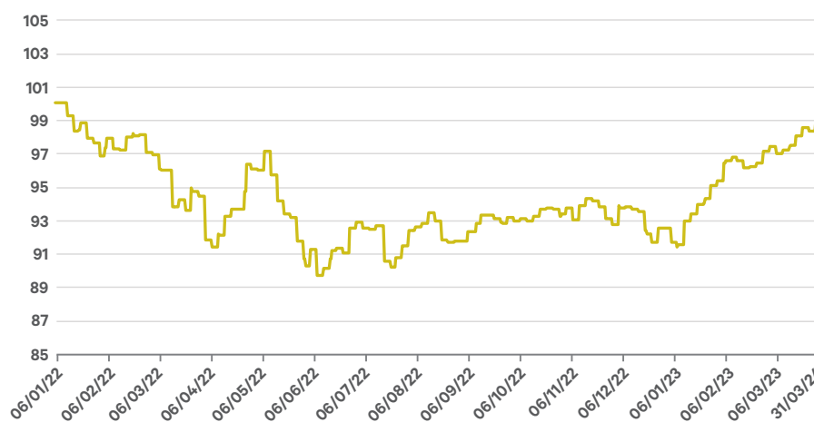
Figure 1: Performance of Davy SRI Cautious Growth Fund at 31 st March 2024