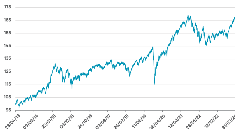
Figure 1: Performance of Davy Moderate Growth Fund at 31 st March 2024 6

Warning: Past Performance is not a reliable guide to future performance. The value of your investment may go down as well as up. This product may be affected by changes in currency exchange rates.